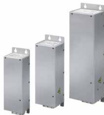
Frame sizes Three different frame sizes of line filters correspond to the M1, M2 and M3 enclosures of the VLT® Micro Drive